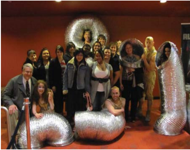
TRiO Students pose with performers of The Aluminum Show

The trip was amazing and worth it in every aspect. We reached Hampton Inn and Suites around 2:00-2:30 p.m. and roamed around Bricktown in Oklahoma City (they don't call it Bricktown for nothing!) for a few hours, looking at all the restaurants. We ate dinner at Zio's Italian Kitchen, and the food and the service there was absolutely amazing. After dinner we attended the Aluminum Show. It was my first time ever hearing about the show, and I was astonished at the creativity and skill behind the whole thing. I kept hearing, "Oh it's a group from Israel that dances with tin foil." That really didn't sound interesting to me at all, but after seeing that the aluminum show was more like a musical with a storyline, I was immediately in love with the whole show.