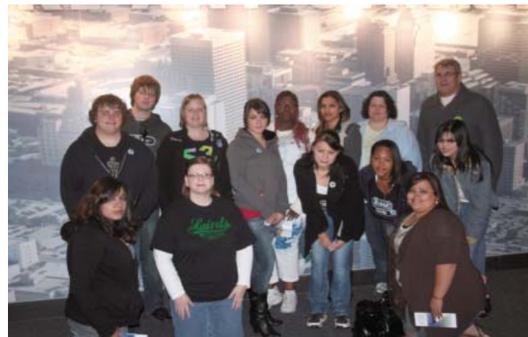
TRiO Students at the OKC National Memorial & Museum