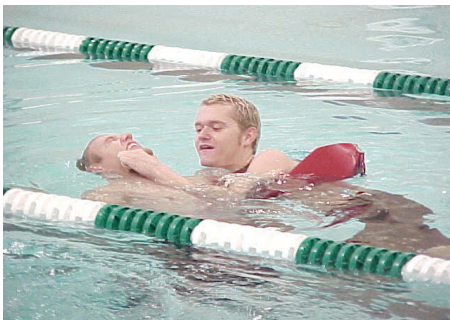
Lifeguard training classes are offered through the physical education department and held in the wellness center's indoor pool.